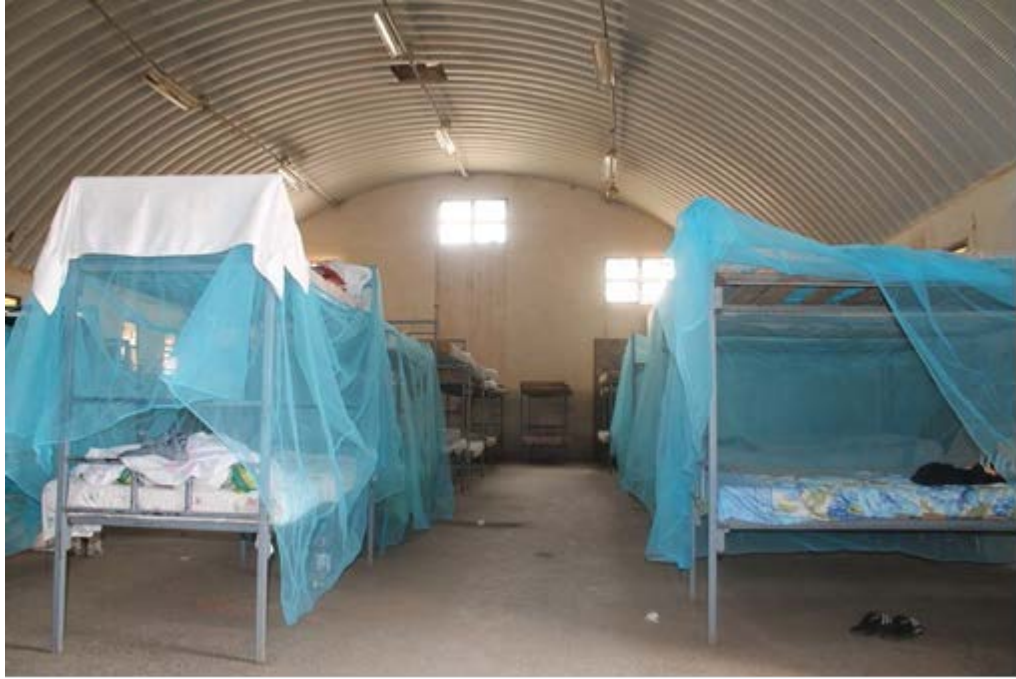
Dormitory in Sawa. The photo was taken in the summer of 2014.